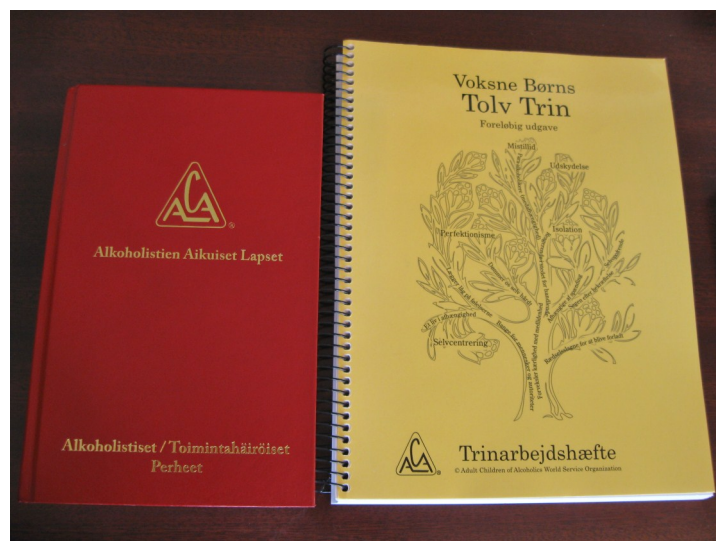
The Finnish translation of the ACA Fellowship Text (l) and Danish translation of the ACA 12 Steps Workbook (r) are now available to members worldwide.

For the first time, ACA World Services has posted translated ACA pamphlets on the fellowship website. To read “ACA Is...” in Spanish, Portuguese, French, Chinese, or German, just visit www.adultchildren.org and select “non-English Literature” from the left-hand menu.